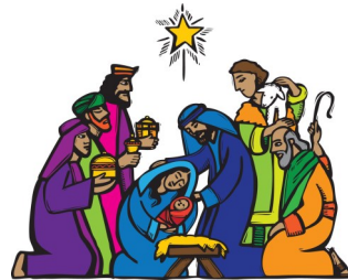
Not Just Another Story

Goodrich United Methodist Church 8071 South State Road Goodrich, Michigan 48438-0186 Church (810) 636-2444 Fax (810) 636-3558 Parsonage (810) 637-4125 www.goodrichumc.org